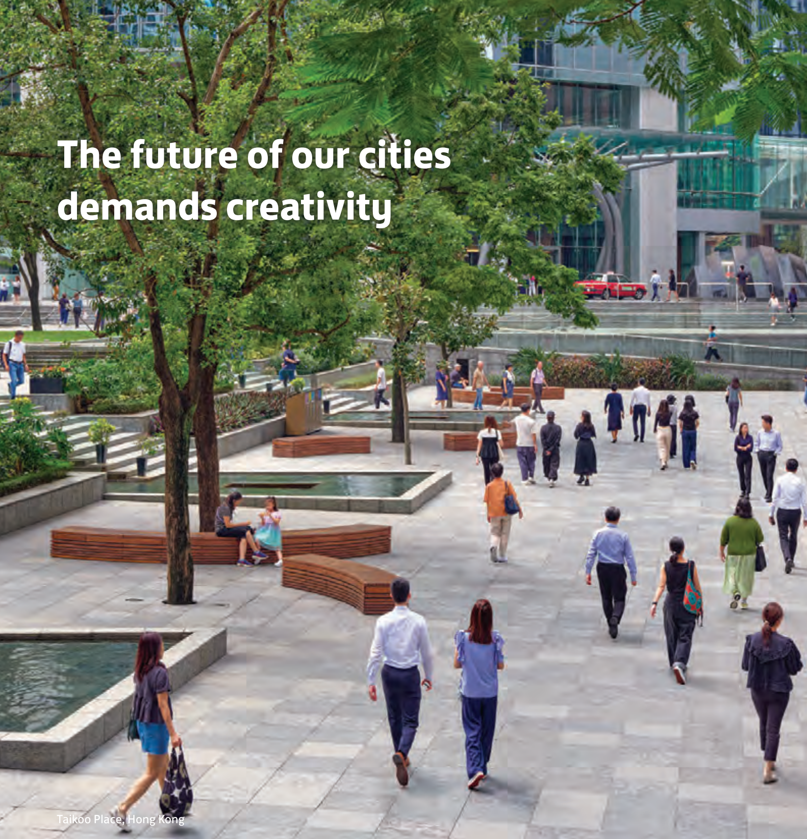
Taikoo Place, Hong Kong

At Swire Properties, we're committed to responsible, sustainable development. Our sustainable development vision drives us to create innovative solutions for cities while aiming for net zero emissions by 2050. As the first real estate developer in Hong Kong and the Chinese Mainland with approved 1.5°C-aligned science-based targets, we're proud to be ranked No. 1 globally in our industry* by the Dow Jones Best-in-Class World Index 2024.