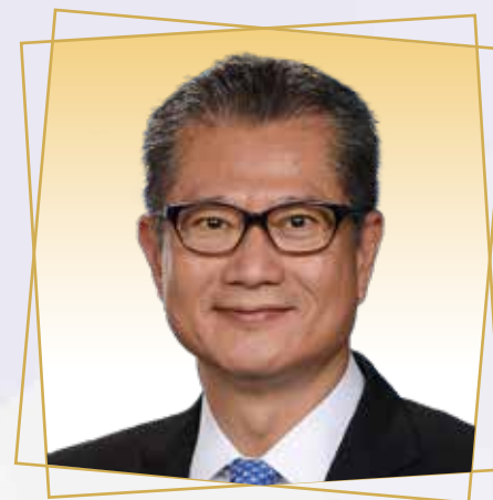
陳茂波先生 大紫荊勳賢, GBS, MH, JP, The Honourable Paul CHAN Mo-po, GBM, GBS, MH, JP

The successful organisation of the Business Journalism Awards is thanks to the enthusiastic participation of the media industry and the generous support from judges from different professional sectors. We wish the Awards could further drive the development and professionalism of business news reporting, making greater contribution for the betterment of Hong Kong.